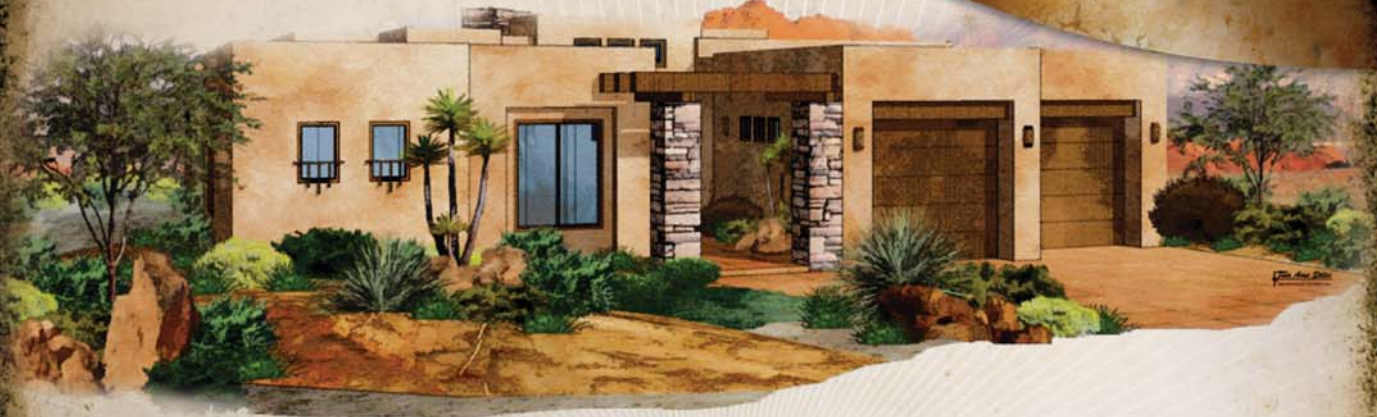
RENDERING SHOWN WITH OPTIONAL UPGRADES